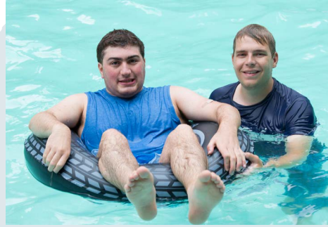
Campers enjoy the pool at Camp Warren this past summer.

art therapy services, which are yielding beneficial results for our campers!